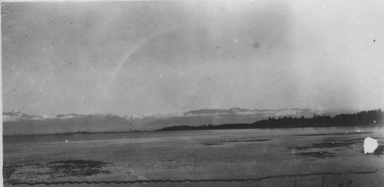
Olympic Mts as seen from William's Head, Vancouver Island, May 1919.