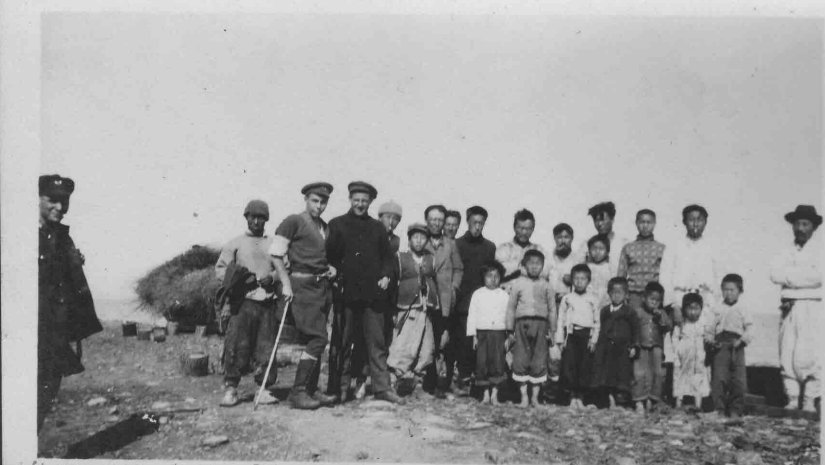
VLADIVOSTOK - PRISONERS JAN. 1919