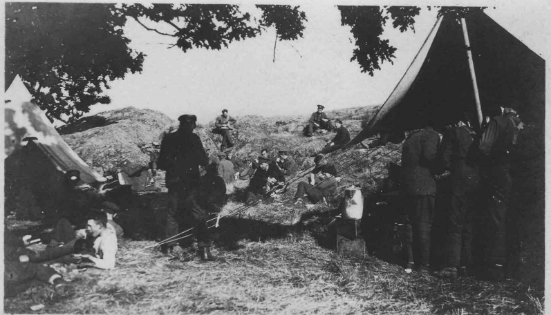
William's Head Camp, Vancouver Is. 1919. Row's Peak