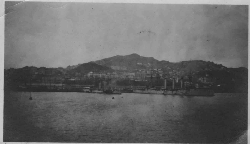
HARBOR AT VLADIVOSTOK, SIBERIA MAY 1919