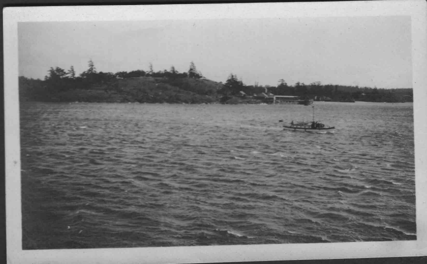
Hilliers Head Quarantine Station on Vancouver Id., Can. Exped. Forces (Siberia) May 1919 on day of arrival from Siberia