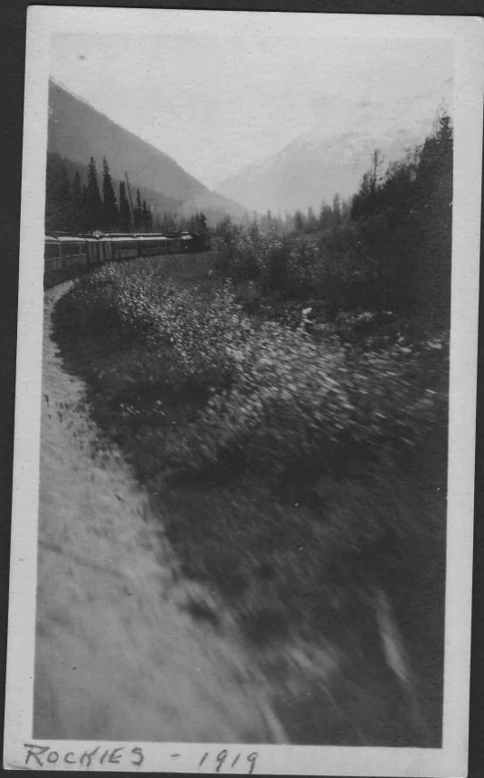
ROCKIES - 1919