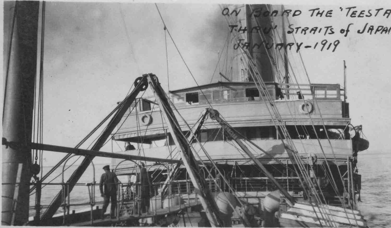
ON BOARD THE 'TEESTA' THRU STRAITS OF JAPAN JANUARY-1919