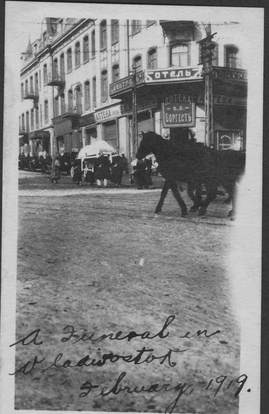
A Funeral in Vladivostok February, 1919.