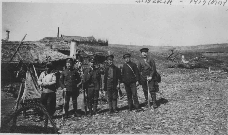
SIBERIA - 1919 (MAY)