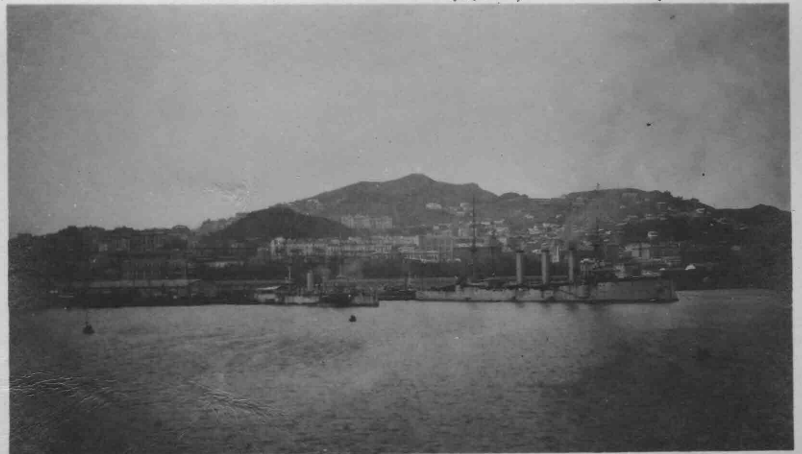
HARBOR AT VLADIVOSTOK - BR. BATTLESHIPS