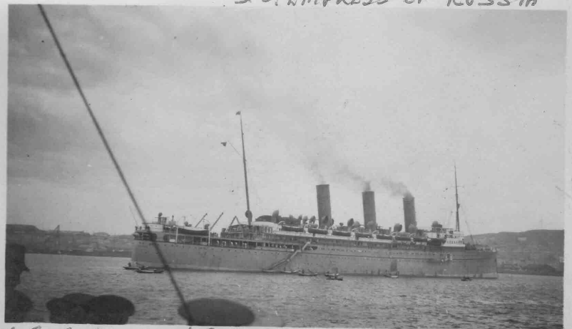
S.S. EMPRESS OF RUSSIA