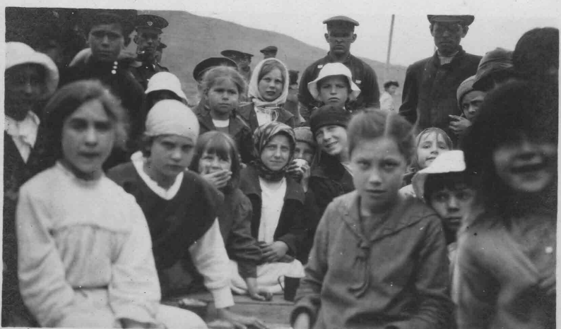
PICNIC - GORNOSTAI BAY MAY 1, 1919