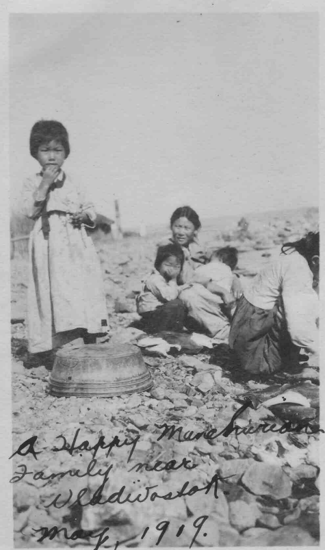
A Happy Manchurian family near Vladivostok May, 1919.