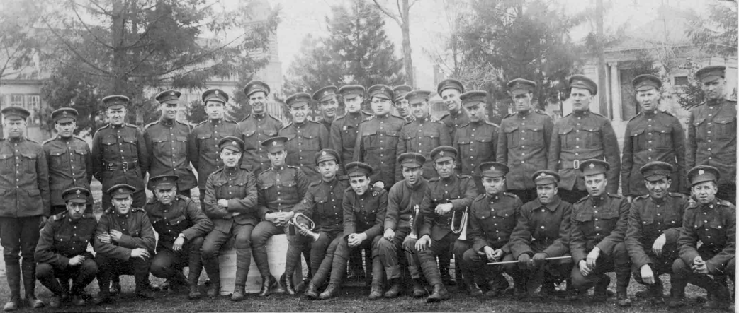
LEH SOLDIERS FROM KITCHENER, GALT & SURROUNDING PLACES 1 ST DEPOT BATTALION, W.O.R., QUEENS PARK, LONDON, MARCH 1918.