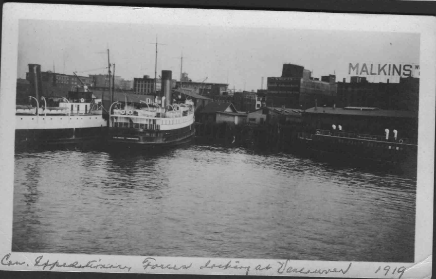
Can. Expeditionary Forces looking at Vancouver 1919