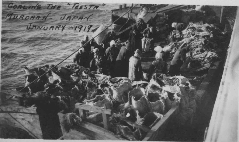
GORING THE "TEESTA" MURORA - JAPAN JANUARY-1919