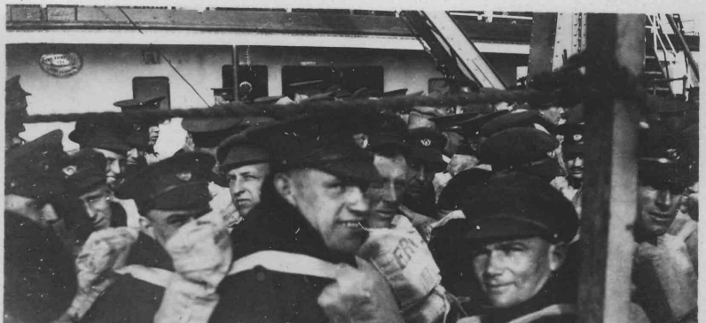
S.S. RUSSIA IN GORNASTAI BAY MAY 14, 1919